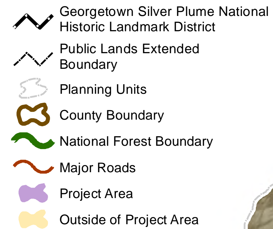
Figure I, Project Area and Planning Units

This map is a visual representation only, do not use for legal purposes. Map is not survey accurate and may not comply with National Mapping Accuracy Standards. Map is based on best available data as of November, 2010.